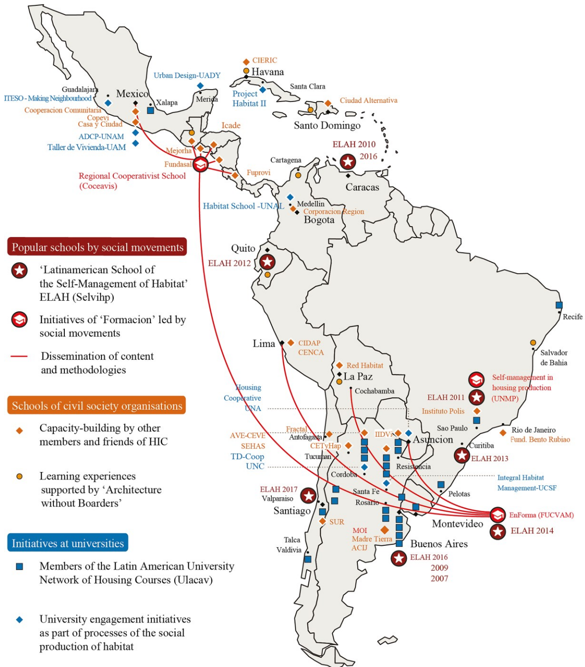
Figure 1. Schools of HIC-AL [Adapted from HIC, 2017, p.143, complemented by interview data. Note that this map does not claim to be comprehensive of all schools (Authors' translation)].

building activities identified by HIC-AL back in 2017. Dark red marks popular schools led by social movements, orange highlights civic initiatives, and blue university-led courses, although all schools operate on a collaborative basis.