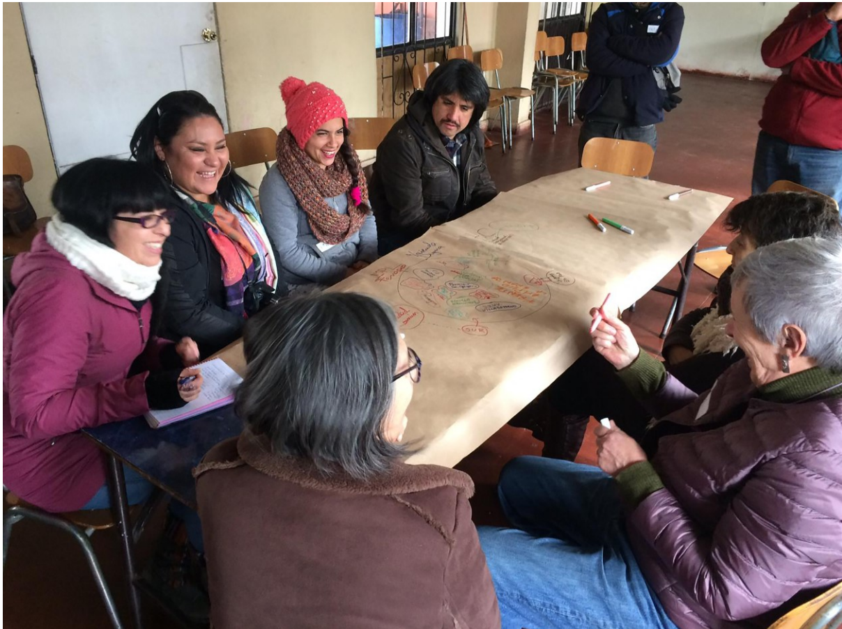
Figure 2. Grassroots pedagogies at work in the School of La Granja, Chile. (Adriana Allen, 2019).

The contextual responsiveness of the schools is also reflected in the shared pedagogic principle of openness of the curriculum, which is sensitive to particular situations. Many schools start by covering basic contents around the right to the city and the social production of habitat to build a shared language. From that basis, the schools' 'curriculum' is fundamentally built around its purpose, be it learning to resist eviction threats or to develop a housing cooperative. This implies that learning is approached as a process of formación de haceres y saberes , where the collective construction of ways of knowing are inseparable from those of doing.