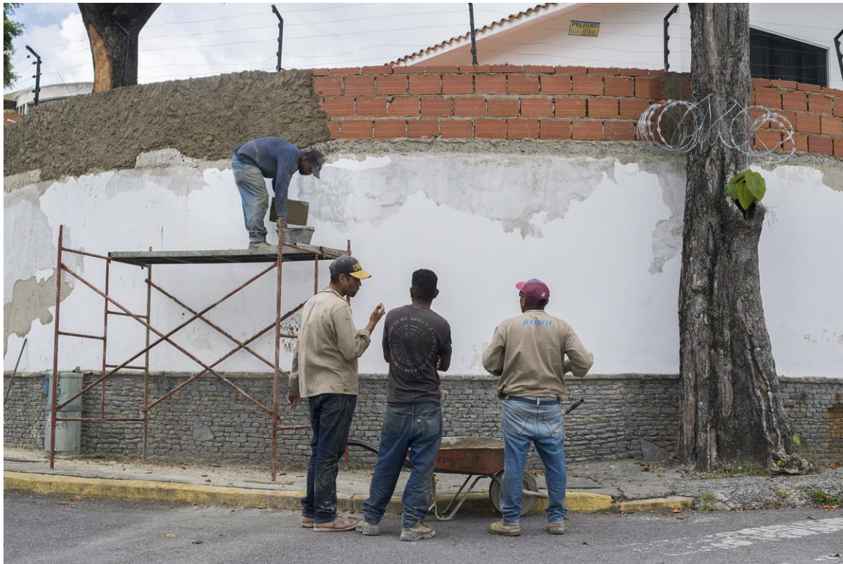
Figure 3. Construction of additional layers on existing perimeter wall.