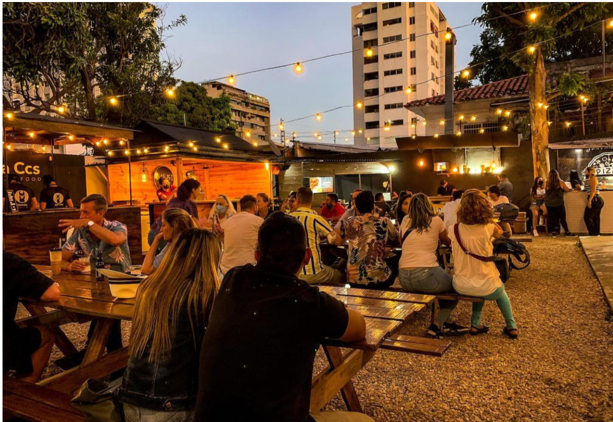
Figure 4. Outdoor area of Streat Market, Chacao.