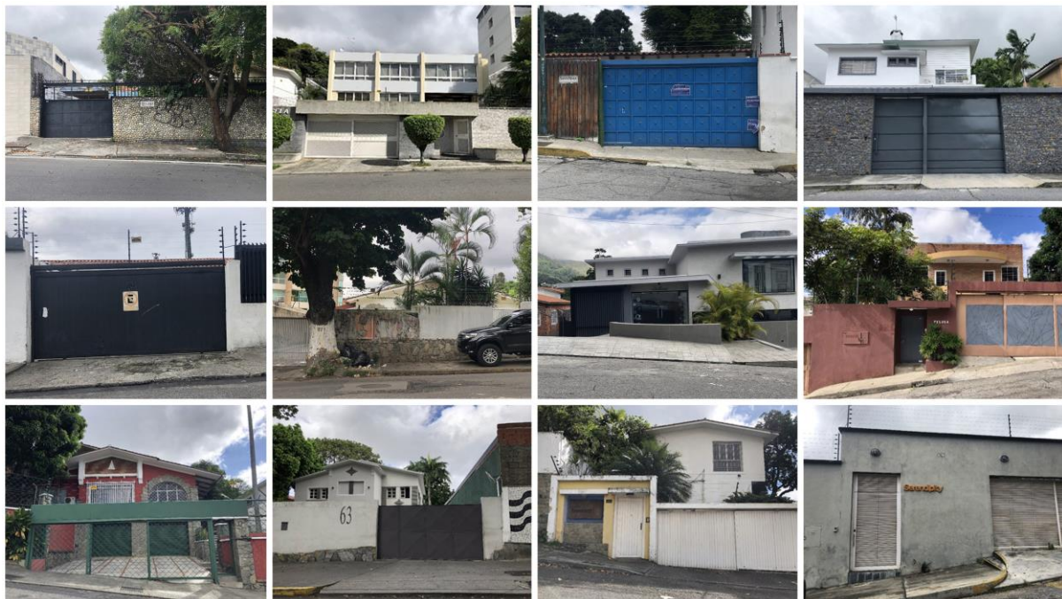
Figure 2. Recently converted homes. New uses are concealed behind tall walls and domestic exteriors.

Achieving privacy and seclusion relies on a single spatial device: the perimeter wall, a ubiquitous architectural feature of residential architecture in Caracas. Its existence predates recent, migration-led, transformations, responding historically to a need for safety amid rising crime rates. As architectural elements, perimeter walls have become the default façades of houses and buildings (Capra-Ribeiro, 2014), an ever-evolving construction where successive layers of masonry, barbed wire, vegetation, electrical fencing, and surveillance technologies are added over time, often surpassing the legal limit of two and a half meters above the sidewalk. Walls, fences, and checkpoints have transformed the city and people's habits, limiting interaction and turning Caracas into a 'city of feuds' (Zubillaga and Cisneros, 2001, p. 162). The experiential gap between vacant streets and lively interiors does not exacerbate a boundary between traditional categories of public and private as much as it highlights a growing economic divide amplified by collapse. In this context, the reprogramming of vacant homes, underpinned by spatial devices and technologies of security, conjugates a new form of gathering space, while the 'real' public realm remains as 'the option for those who have nowhere else to go,' in the words of María Christina Silva (M. Silva, personal communication, November 11, 2022).