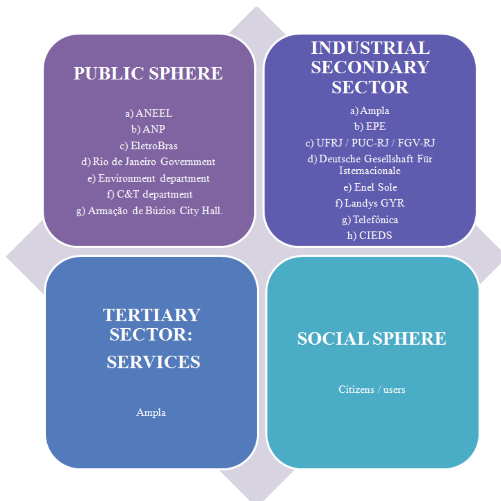
Figure 2. Relevant groups and institutions identified in Smart City Búzios project.

This process of the 'disposal' or 'commercial negotiation' of urban space is what Harvey (2005) calls 'entrepreneur city'. In his text, Harvey explains this model of the city equates to a business model of free competition, based on: a) public-private partnerships, b) speculation, which is a natural process in entrepreneurship, and which exposes urban environments to risks and uncertainties, and c) political economy, placed in greater prominence than territorial constraints. Kumbhar et al. (2012) affirms that smart grid projects tend to be closely related to this type of process. In their paper, they argue that although there is a focus on well-being, it is common to have intense competition related to the sale of these projects between companies.