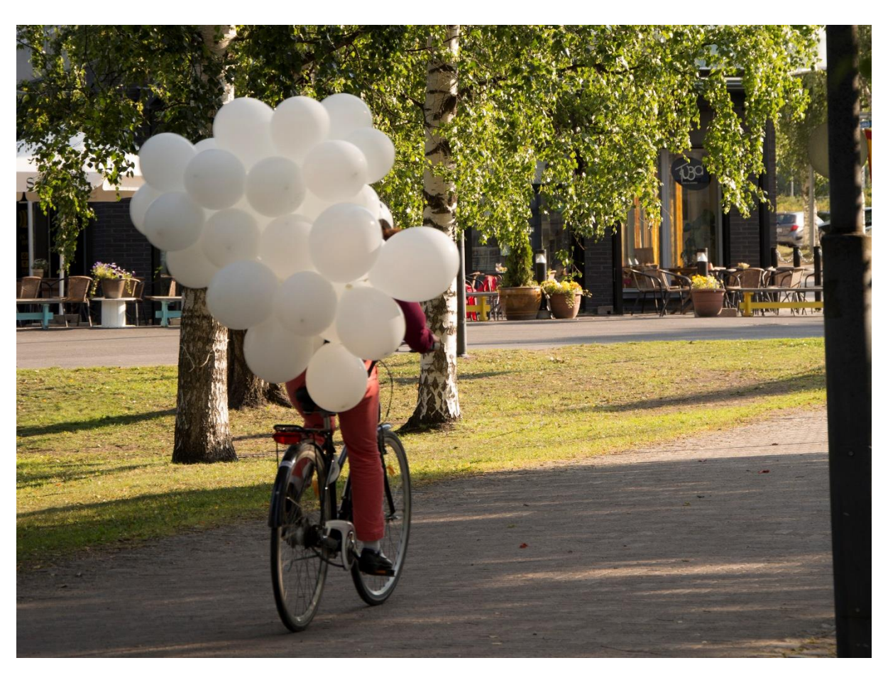
Figure 7. On the following day, we announced dismounting our installation in social media, sharing its physical pieces on-site. Locals expressed notable interest in the balloons and parts of the work travelled to nearby cafés, schools and private homes.

After all, the key point of cultural engagement overwhelms economic value and focuses on empowerment on the community (Sacco & Tavano Blessi, 2009). The process overtakes the product, goes 'beyond object making and puts the maker inside the place rather than removed from it' (Wortham-Galvin, 2013, p. 36). Thus, the two, place and process, become inseparably intertwined.