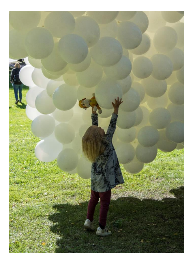
Figure 4. Children were especially fond of the materiality.