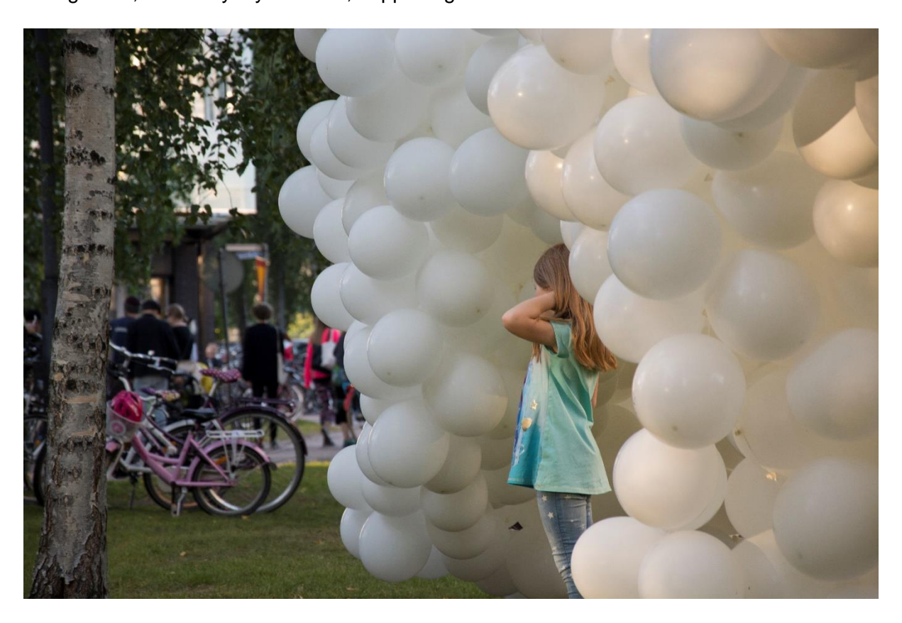
Figure 3. Our art installation of white balloons offered a beautiful backdrop for photography.

Engagement with the material sculpture provided an unambiguous place-making element. It activated the park in micro scale and formed a unique experience consisting of data, knowledge on urban life, concrete small-scale experience and spatial activation, which was noted and praised some days later by a regional newspaper Kaleva. The location in the middle of a green park enabled an experience through the place, and emphasised the place-basedness. Through its white colour, the piece was simultaneously overly visible, like an alien form in the park, and simultaneously, a neutral tabula rasa. The installation represented a background, like everyday life itself, happening around us.