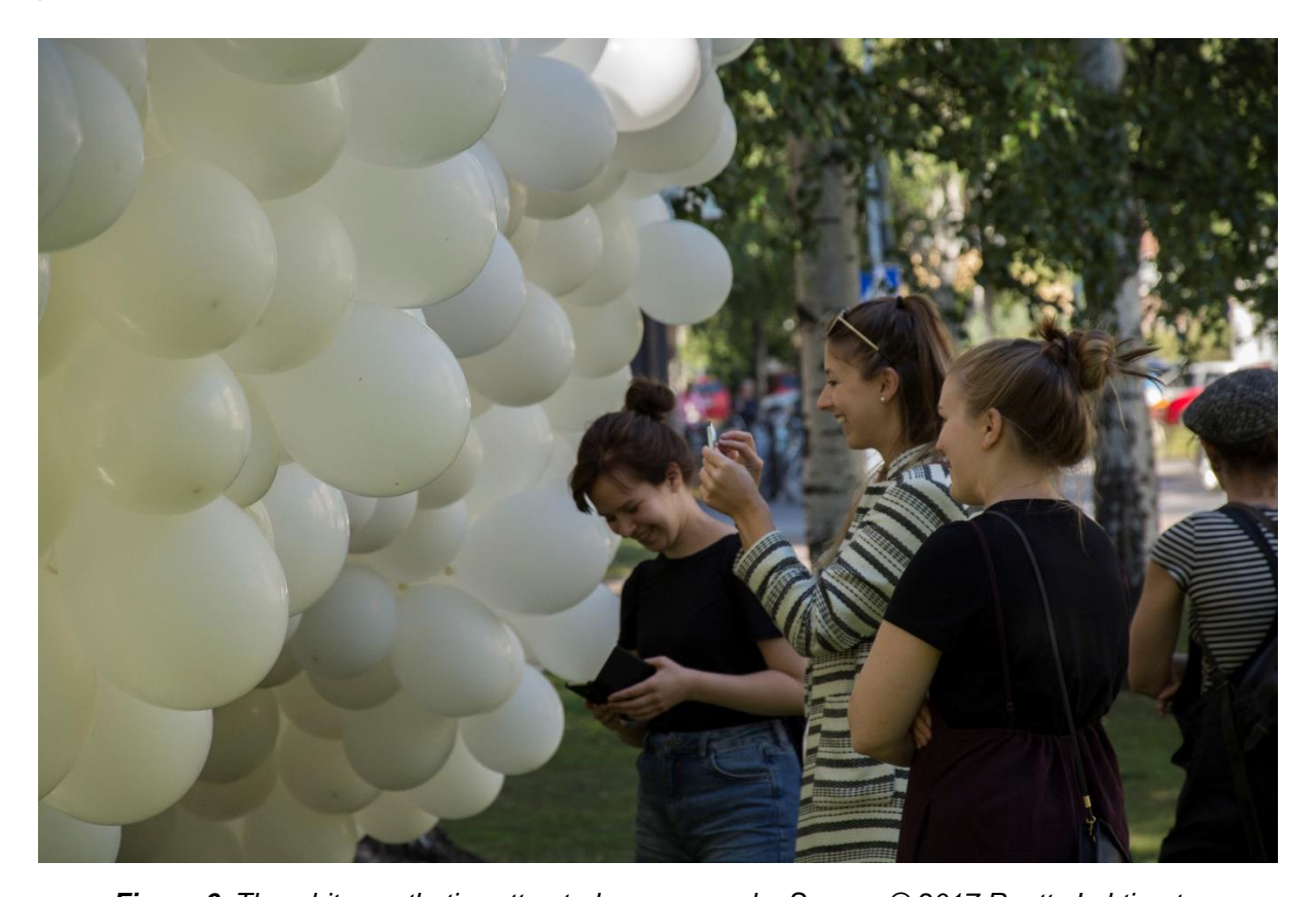
Figure 6. The white aesthetics attracted young people.

Our focus in the small and the mundane underlines its relational aspect. Oulu's regional leading newspaper mentioned our pilot project in its Sunday number, three days after the actual event (Kaleva 20.8.2017) with a title 'Beauty lies in small things'. 'Architecture students counted that appr. 3600 people pass through Åström park in a day. The observations were transformed into an art installation Datapilvi for Oulu Night of the Arts. 3 600 balloons told about life in the park. In this small-scale urban event, information and visitor experience were combined. There are many small urban events taking place in Oulu, covering just a street or a neighbourhood. A successful event is not measured in the number of visitors or expensive performers.'