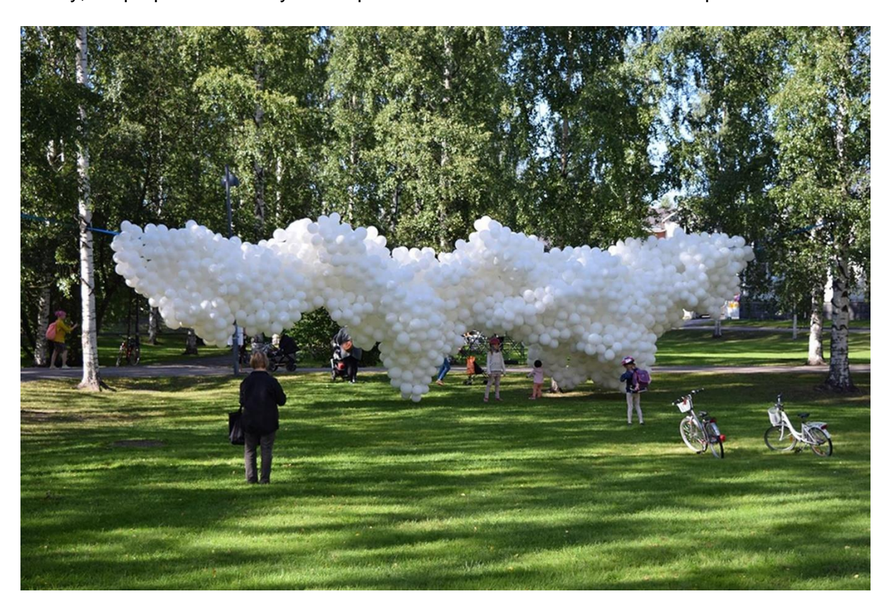
Figure 1. Art installation in the annual event Oulu Night of Arts in August 2017. Installation of 3600 balloons acts as a case study in this paper, providing an empirical case to discuss the development of a new, conversational planning tool.

Within the theoretical background, we develop our argument by distinguishing both productive and obstructive conversational characteristics of intervening with a data art installation in contemporary urban setting. Subsequently, we explore the hypothesis with an action research study that was conducted as a data art installation in 'Oulu Night of Arts', August 2017 (Figure 1). The case study was implemented following a three-phased Field Action Research method. Based on the preliminary findings of our case study, we discuss the abilities and limitations of art installations as conversational devices. Our research inquires the potential of a material, artistic object to connect the space and the process, align urban dwellers and their embodied experiences with the representational, meta-level urban processes that planners conduct. Finally, we propose art as a yet unexplored means of urban conversation opener.