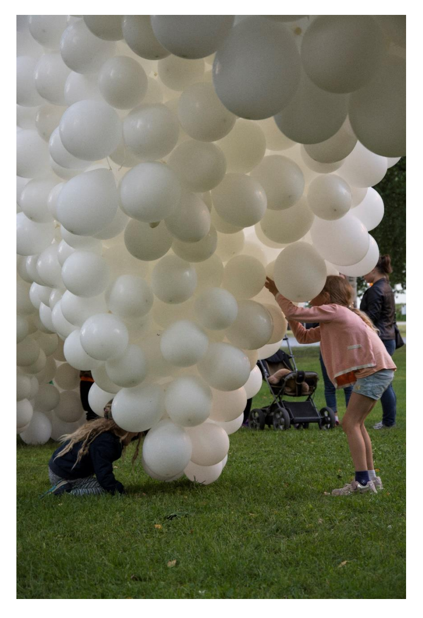
Figure 5. Engagement with the sculpture.

relaxing alone and together, discussing on-site and on-line, commenting on various media platforms. It pursued ways of involving groups outside of administrative participation processes, especially illiterate, such as small children or novel immigrants. Although we encountered these groups on-site, the lack of verbal communication complicated understanding their experience. The work was abstract and interpretable in various ways. Material presentation and visual presence of balloons in amount of visitors aroused surprised reactions.